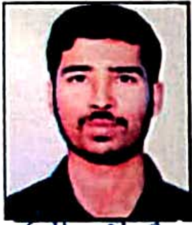
Dhanaraj Signature of Holder

O/o Superintendent of Post Offices, Bidar Division, Bidar-585401. Ph: 08482-225350